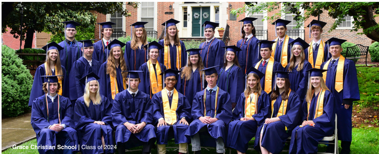
Grace Christian School | Class of 2024